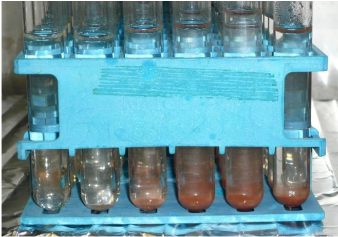
Fig. 4.2.1-1 Iron-containing sample after acidic persulfate digestion (red colour probably caused by iron oxides transformed to hematite)