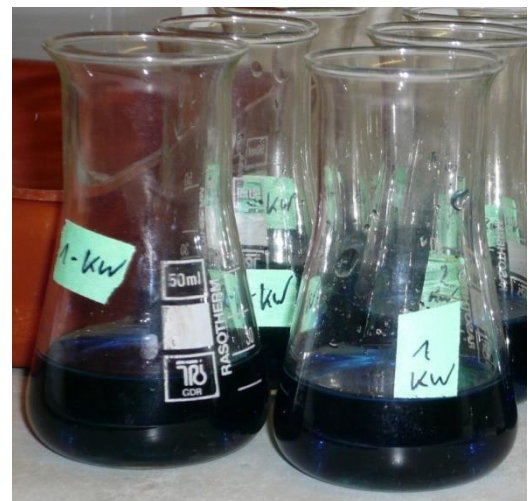
Fig. 4.1.2-2 Non-neutralised blanks (digestion in neutral persulfate solution), stored overnight in centrifuge tubes with extremely deep blue colouring. KW: Kraftwerkswasser (very clean, P-free water from "Kraftwerk Rostock")

Handbook on the selection of methods for digestion and determination of total P in environmental samples