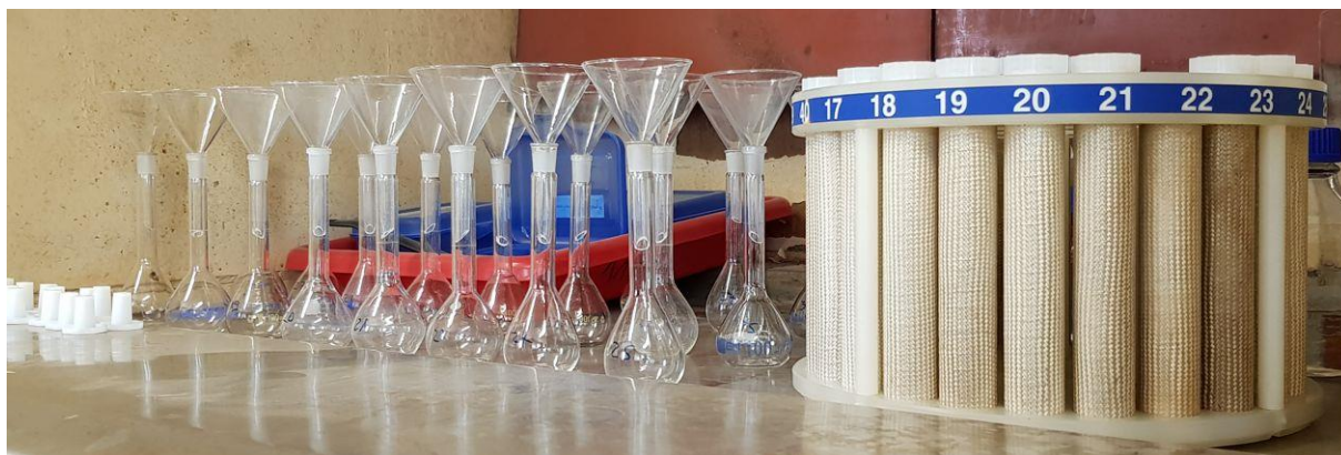
Figure 4.1.2-3 Volumetric flasks with funnels for filtration of soils, vessels of microwave in burst protection covers (MarsXpress)